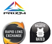
HNBL S Matte Black w/ Prizm TR45&TR22&Clr OO9281-05