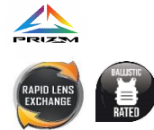
HNBL S Matte Black w/ Prizm Grey OO9281-03